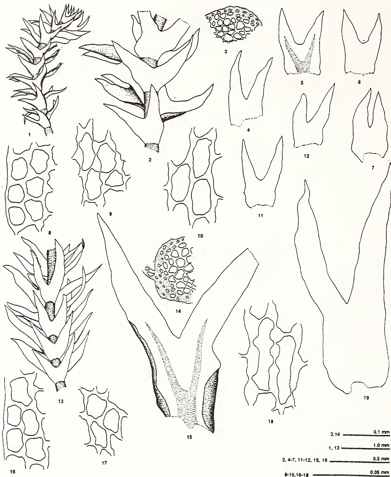
Fig. 3: Herbertus ceylanicus (Steph.) Miller. 1-12. (LWG 201208-A):

1. Plant ventral view; 2. Plant magnified view; 3. Cross-section of stem; 4-7. Leaves; 8. Leaf marginal cells; 9. Leaf median cells; 10. Leaf basal cells; 11-12. Underleaves